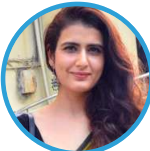
Fatima Sana Shaikh